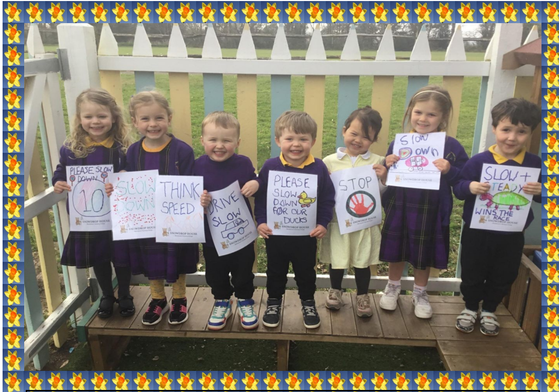
Children from the Montessori Nursery in Franklands Village with their road safety signs